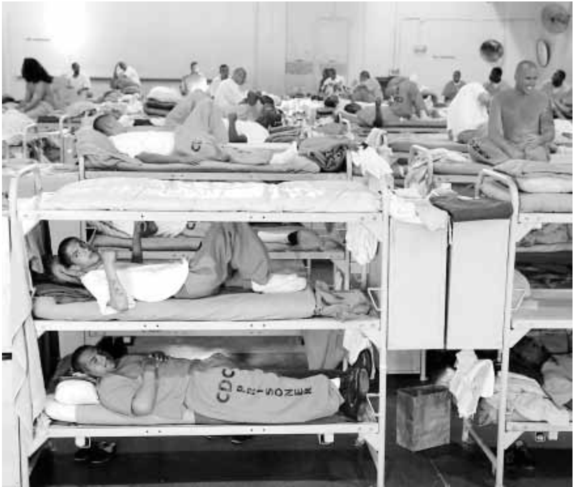
An influx of offenders forced the states to build more prisons, but annual costs as high as $50,000 per prisoner are spurring a search for new answers.

and incarceration, the prisons would have begun emptying out in the late 1990s, when crime in most of its forms began to decrease.