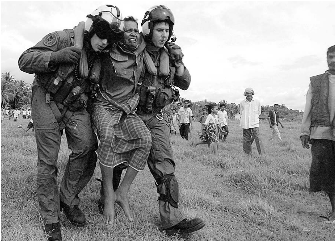
Two U.S. naval crewmen carry an injured Banda Aceh woman to a waiting helicopter in January 2005. Indonesian officials allowed international relief teams to enter areas devastated by a tsunami, but this year Myanmar's government rebuffed a similar outpouring of aid to help victims of Cyclone Nargis.