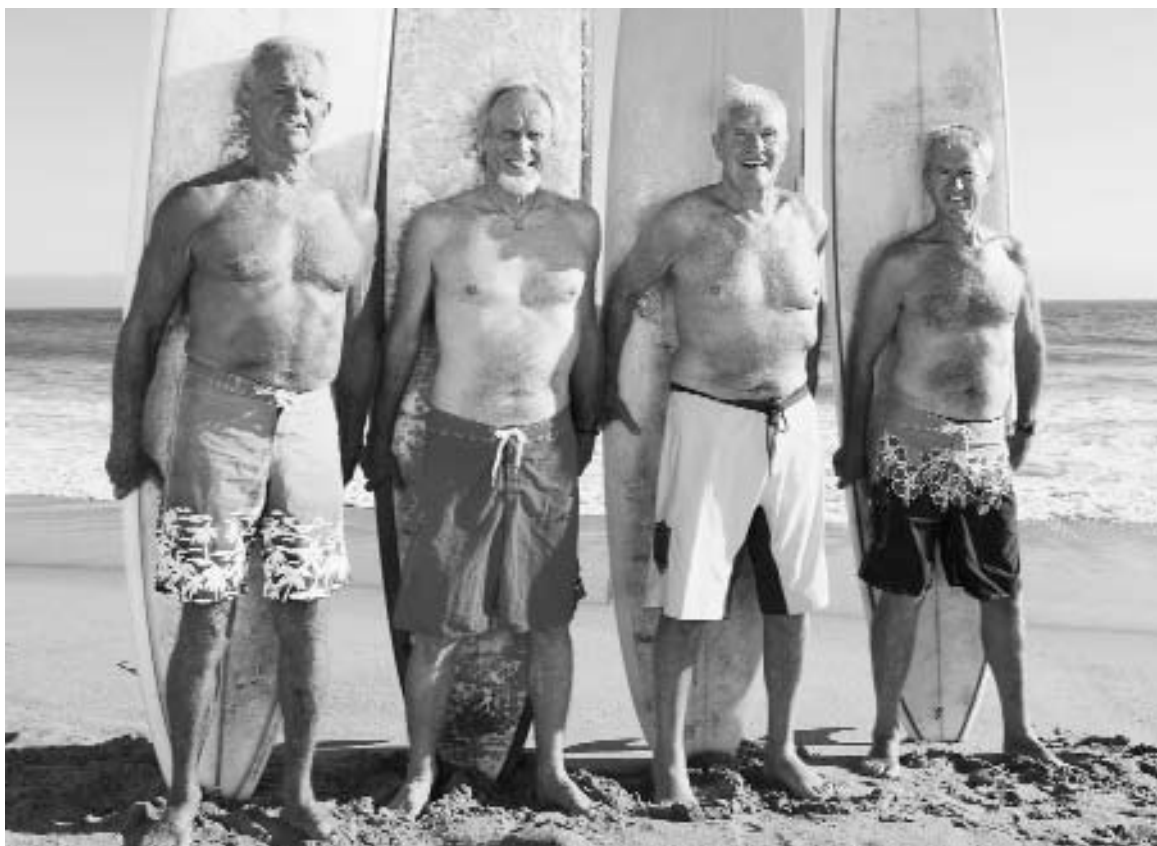
When surf's up, who cares whether PSA levels are up too?

mercenaries. They were compressed into “aarp,” the sound a goldfish might make if it tried to bark.