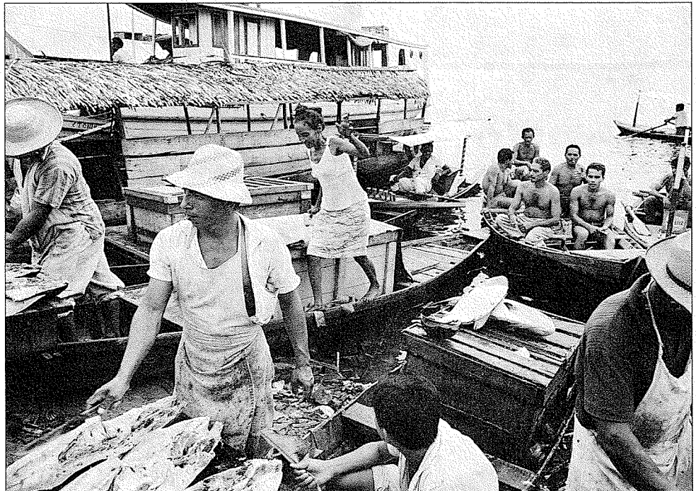
A Manaus fish market brings together a cross-section of Amazon River people.

Rubber wasn't the only thing that brought people to the forest. As recently as the 1970s, the government of Brazil sometimes transplanted people to the Amazon in an effort to relieve famine and overcrowding elsewhere. Most who came lacked jeito , the forest