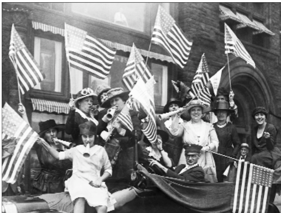
Just 50 years after the Wyoming Territory, where women were in short supply, used the vote as a carrot to draw the “ladies” west, suffragists celebrated the passage of the Nineteenth Amendment in August 1920.

day—soon—women would be voting even in state races.