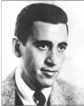
J. D. Salinger in 1951, when he published The Catcher in the Rye .