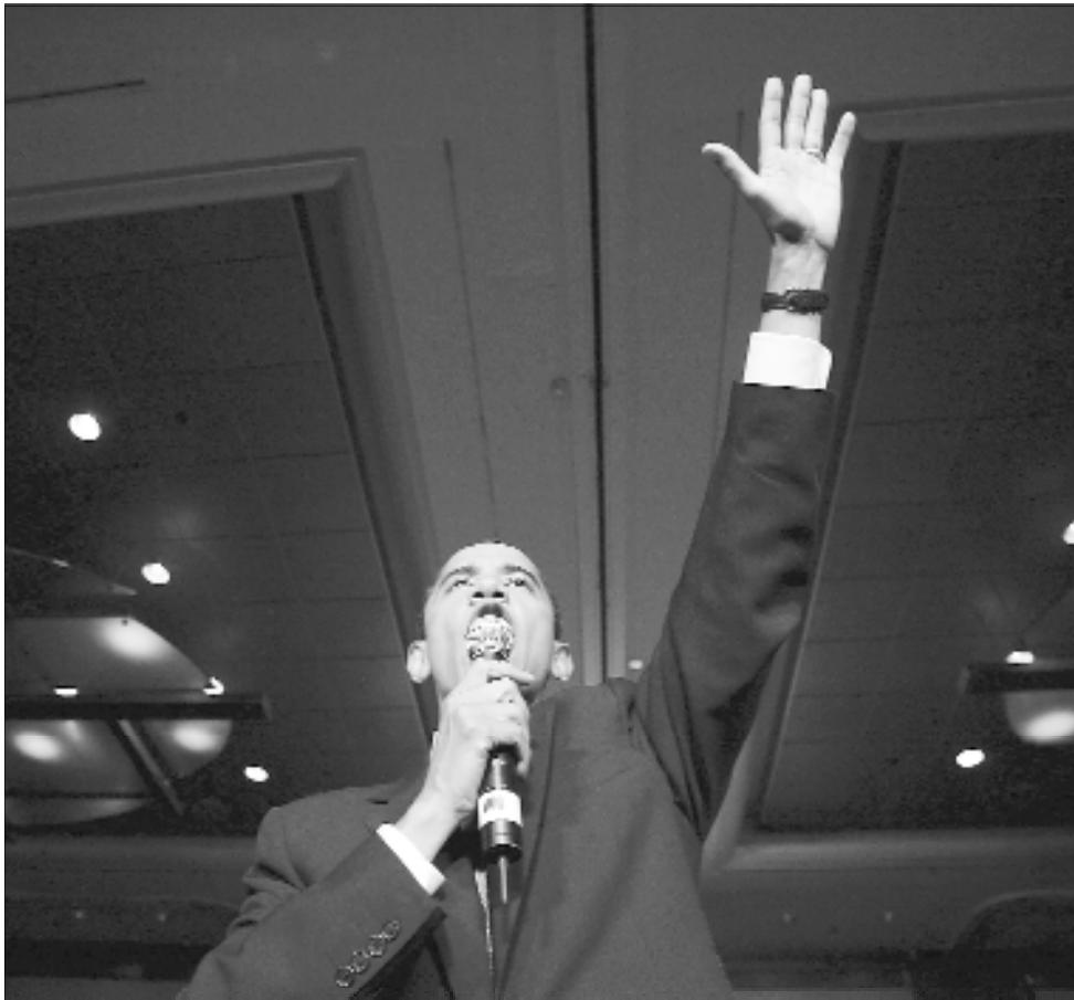
Senator Barack Obama (D-Ill.) cites his mother's faith as the source of his own views on tolerance and racial harmony. He often invokes the term spiritual as a key to these "broader values."

All this criticism of the "new spirituality" has obscured and diminished what is, in fact, an important American tradition, one in which spiritual journeying has long been joined to social and political progressivism. Emerson's "endless seeker" was, as often as not, an abolitionist; Whitman's "traveling soul," a champion of women's rights; Henry David Thoreau's "hermit," a challenger of unjust war. A good sense of the continuing moral and political import of this American vocabulary of the spirit comes from Barack Obama, the recently elected Democratic senator from Illinois. Obama has said that, despite the results of the 2004 election, it "shouldn't be hard" to reconnect progressive politics with religious vision: "Martin Luther King did it. The abolitionists did it. Dorothy Day did it. . . . We don't have to start from scratch."