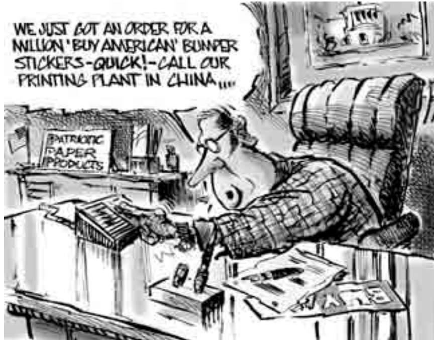
Hard times make one thing more plentiful: wishful thinking about a retreat from foreign trade.

globalization and global capitalism create new forces of "creative destruction," America will have to restructure its economy and society in order to compete. It will need to confront its enormously wasteful and inefficient health care policies and the deteriorating standards of its public education system. It must