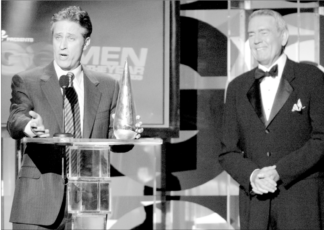
It seemed funny when Dan Rather gave GO's "Voice of Reason" award to Jon Stewart of The Daily Show in 2003, but less so when the comedian was mentioned as Rather's replacement.

is the driving force of civilization. Stop obsessing about your troubles. Calm down and get back to work.