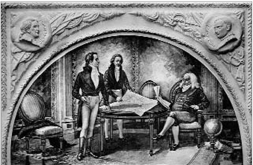
James Monroe, who was Jefferson’s special envoy, and U.S. Minister to France Robert Livingston negotiate details of the Louisiana Purchase with the formidable French foreign minister Talleyrand (seated).

Jefferson had no idea how to respond to the looming threat, beyond sending his friend and