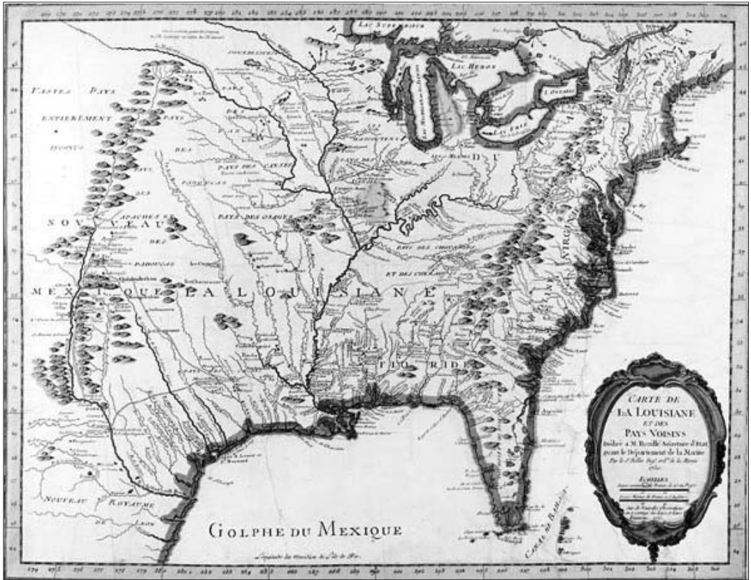
A French-made map shows what was known of the Louisiana Territory and the distant West in 1755. It was not until the 1804–1806 expedition of Meriwether Lewis and William Clark that cartographers could begin to describe in detail the western reaches of the Purchase.

president suggested. The Spanish remained in control of New Orleans, the key to the great river system that controlled the continent’s heartland, and the British remained a powerful presence to the north.