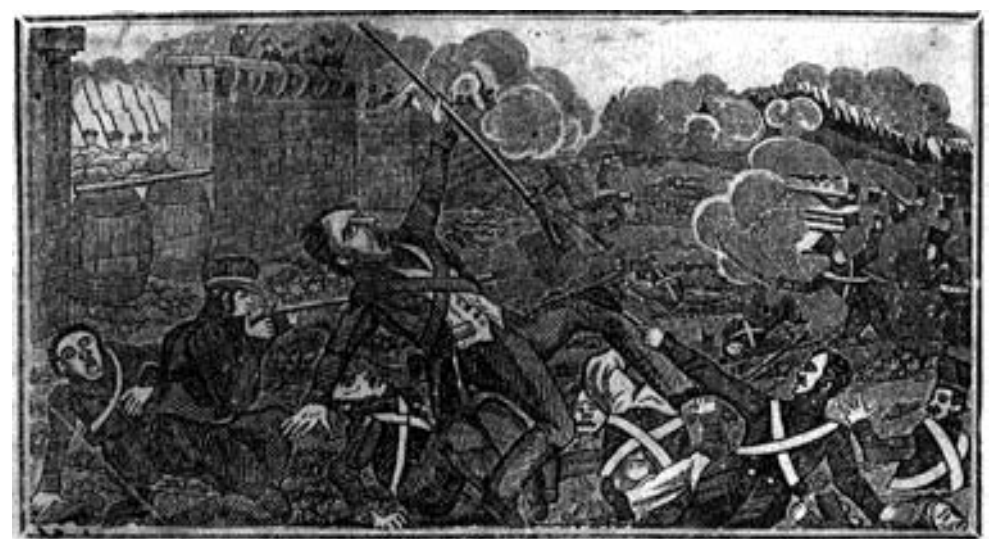
Fall of the Alamo - Death of Crockett, circa 1837