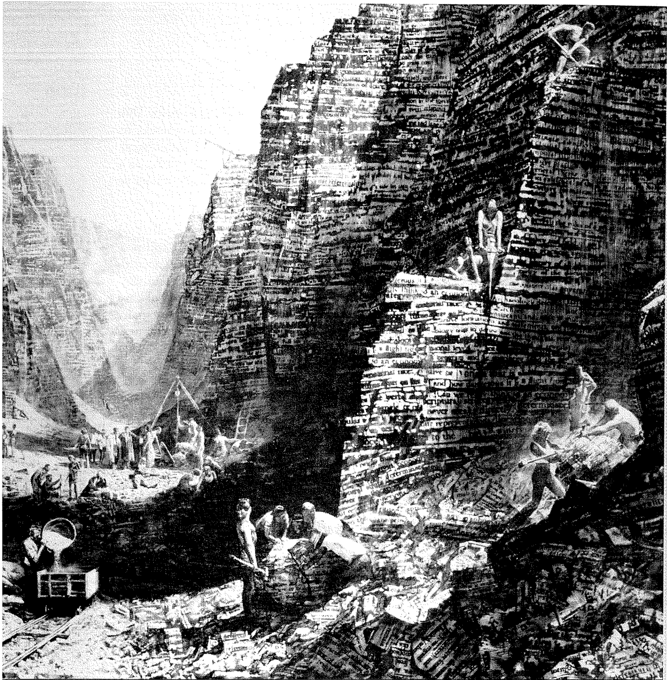
Deconstructionists and other literary theorists—including Jacques Derrida, Paul de Man, and Geoffrey Hartman—at work in Mark Tansey's wry "Constructing the Grand Canyon."

and language. There is little attention to the "common reader" of the kind that Virginia Woolf sought to address, while, ironically, the life of Mrs. Woolf has itself become a cottage industry and her work (despite her strictures) an icon for ardent feminist critics.