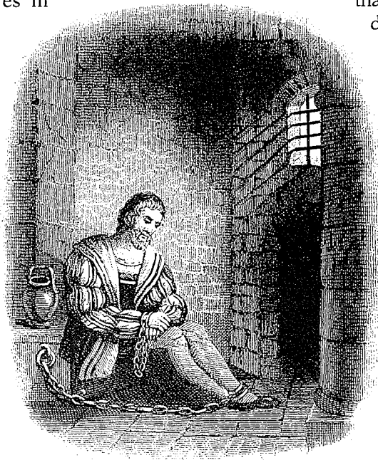
Columbus disgraced, 1500. Charged with malfeasance as governor of Hispaniola, Columbus returned to Spain a prisoner in chains.

volume of fresh water flowing from the Orinoco River was evidence of a large land, but he failed to appreciate that this might be a continent or to pursue his investigations. Instead, his mind drifted into speculation that the river must originate in the Earthly Paradise. Bound to medieval thinking, the man who showed the way across the ocean lost his chance to have the New World bear his name. The honor would soon go to a man with a more open-minded