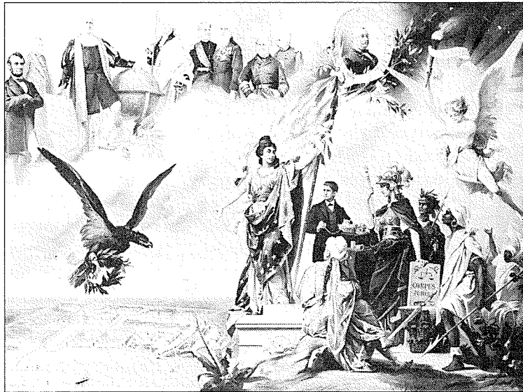
Father of a country he never knew. This 1893 painting establishes Columbus with Lincoln and Washington as America's "holy trinity."

But now the good news: In anticipation of the 500th anniversary an enormous amount of intellectual activity has occurred, in the form of archival discoveries, archaeological excavations, museum and library exhibitions, conferences, and publications. Some 30 new and upcoming adult titles have been enumerated by Publishers Weekly . Over 100 exhibitions and conferences have been counted by the National Endowment for the Humanities. This remarkable efflorescence of original research and scholarship will leave a lasting legacy of understanding and good. On the twin princi-