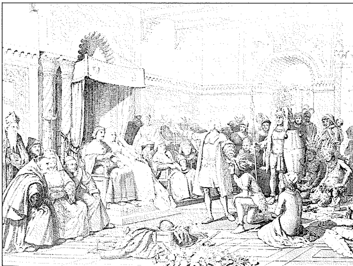
Columbus triumphant, 1493. To Ferdinand and Isabella, Columbus presented not only trophies and treasures from his voyage but a bold scheme for colonizing the new-found lands.

Columbus refused to accept rejection. By this time, his wife had died, and in 1485 he took their son, Diego, and left Portugal for Palos, across the border in Spain. Tradition has it that Columbus and little Diego, penniless and hungry, got off the ship and trudged along a dusty road to the Franciscan monastery of La Rabida. He knocked at the portal to beg for water and bread. If the legend is true, the father may have been taking the