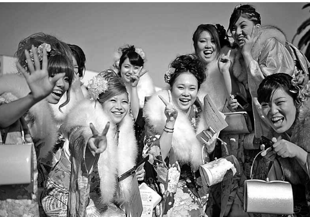
Young women celebrate “Coming of Age Day” in a Tokyo amusement park. The January holiday for those who turned 20 in the previous year has seen declining participation as perceptions of adulthood change.

to their elders as increasingly onerous and optional. The hopes and expectations falling on this dwindling cadre of youth would be truly enormous—and for some fraction of the rising generation could amount to an unbearable pressure.