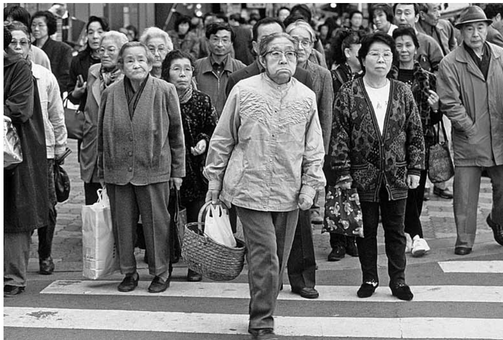
An age wave is descending on Japan, promising to make what is already the world's “grayest” society into one with a median age close to that of retirement havens such as Palm Springs, California.

Projections by Japan's official National Institute of Population and Social Security offer a stunning picture of the possible future for today's young Japanese. Consider, for example, a woman born in 1990, now 22 years old. Given current trends, the institute estimates her life expectancy to be around 90, maybe higher. But children—and family, at least in the current understanding of the term—may very