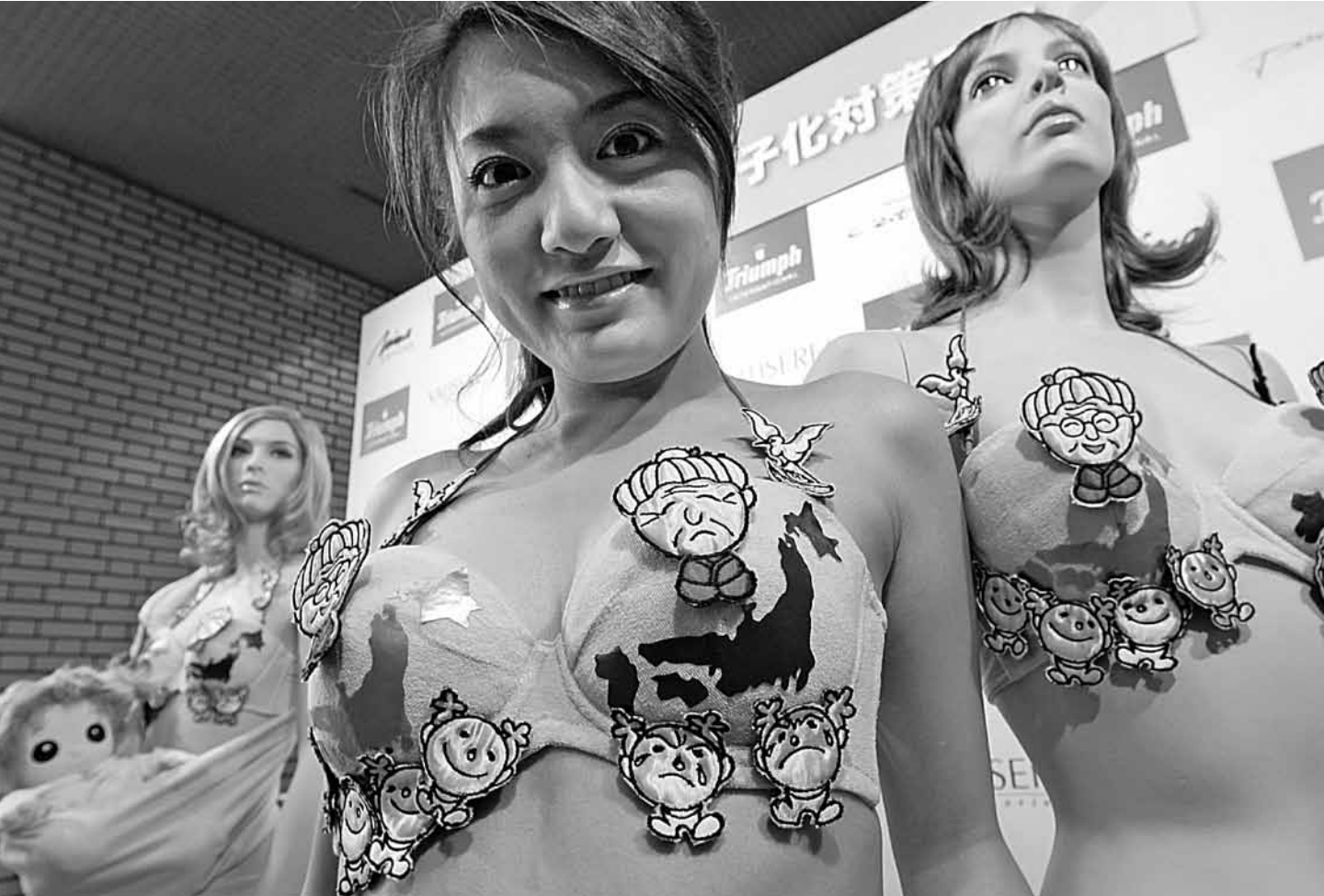
"Stop the birthrate decline!" was the theme behind a line of lingerie launched in 2006 by a Japanese firm. The children embroidered on the bras are supporting elderly women and Japan itself, while the line's signature phrase was emblazoned on other items in the line.

Japan's postwar fertility plunge has been so steep that it can be described as a virtual collapse. In 2008, barely 40 percent as many Japanese babies were born as in 1948. [See chart, page 32.] In fact, the country's